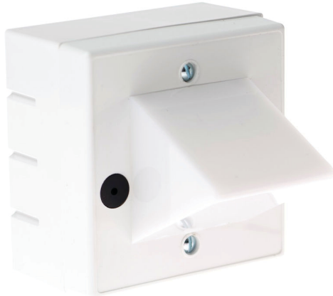
Sounder / Beacon Receiver